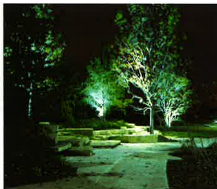
Prairie Stone Business Park, Hoffman Estates, IL

It is important to keep in mind that less is more. If the architectural lighting is overpowering, then the subtleties of the landscape are lost.