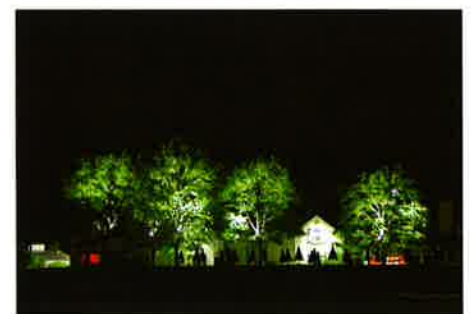
Indian Hill Golf in Winnetka, IL