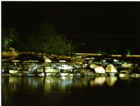
Dell Webb Sun City in Huntley, IL

With careful consideration, the landscape story can be told after dark by providing a visual harmony between the key site and landscape elements. If the trees are large enough they may be used to install attractive fixtures in the canopy of large trees, which creates drama by offering delicate moonlight shadows filtered through the trees onto the walkways, sitting areas, roadways and parking lots. When nighttime falls, light can be used as a paint-